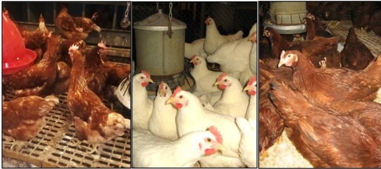
Figure 1: Experimental stocks with three different genetic backgrounds (commercial hybrid (left), purebred offspring of maternal (in the middle) and paternal lines (right)).

A total of 53 nineteen-week-old pullets (1041 cm 2 /hen) were housed in the 12 alternative pens, each with a floor area of 5.52 m 2 . In each pen, 1/3 of the floor space consisted of a scratching area littered with wood shavings, while the remaining 2/3 of the floor space consisted of an elevated plastic grid floor (Figure 2).